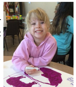
Parents' Night Out

We're trying out some new events this summer. Events are open to the public and all of our St. Paul kids. We hope you will join us!